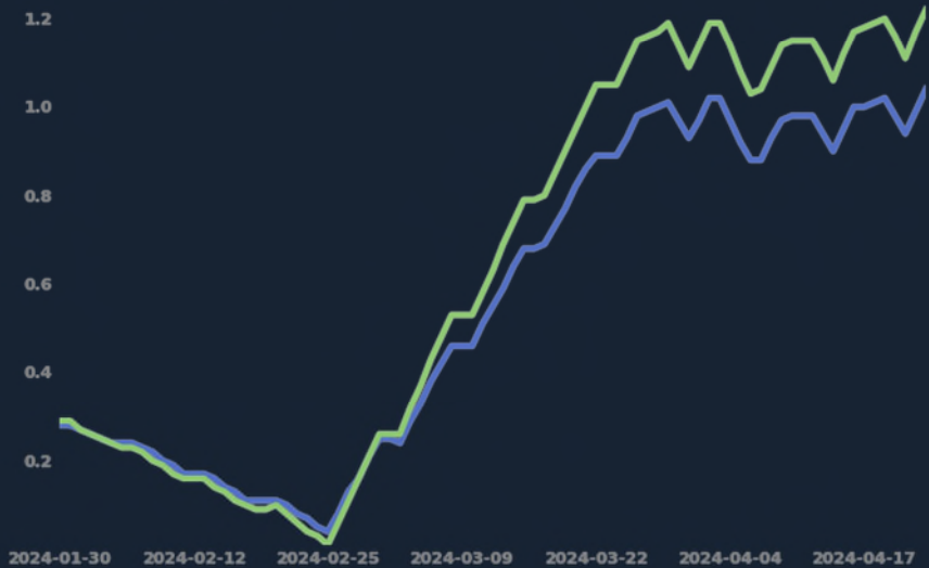
Micro Connect Cash Yield

Since February, the Micro Connect Cash Yield Index for group meals has grown rapidly, significantly driven by lower-tier cities. From February to April, the growth rate of group meals in fifth-tier cities exceeded the national average, indicating that lower-tier cities have substantial consumption potential in this category.